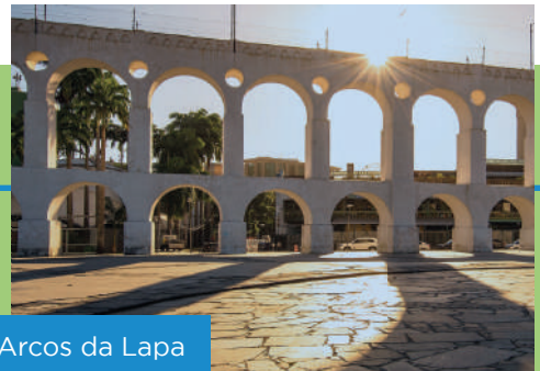
Arcos da Lapa

And last but not least for the explorers: Both the main bus terminal, from where one can visit almost every corner of this huge country, as well as the domestic airport are within a quarter of an hour from FGV by taxi. In-state attractions such as the beaches of Arraial do Cabo, Cabo Frio or Búzios, as well as small (former) fishing towns such as Angra dos Reis or Paraty and the nearby Ilha Grande can be reached by bus within few hours.